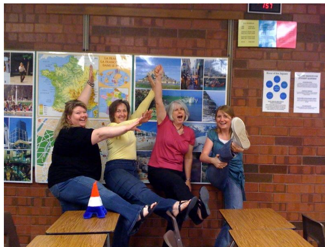
Collaboration at its finest vive les profs de français

Getting-to-know-you activities, complete the drawings, communicative activities, board games with pictures and dialogue, menu reading, jigsaw stories, map reading, giving an opinion, perceptions in advertising,